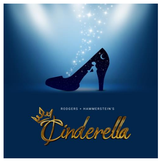
"Cinderella" 8:00PM start