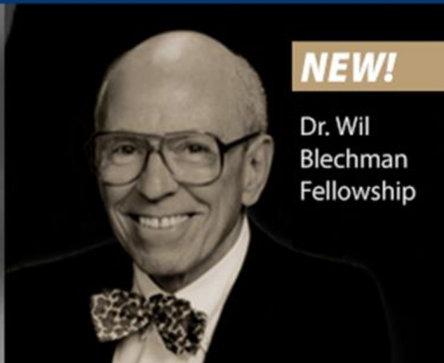
NEW! Dr. Wil Blechman Fellowship